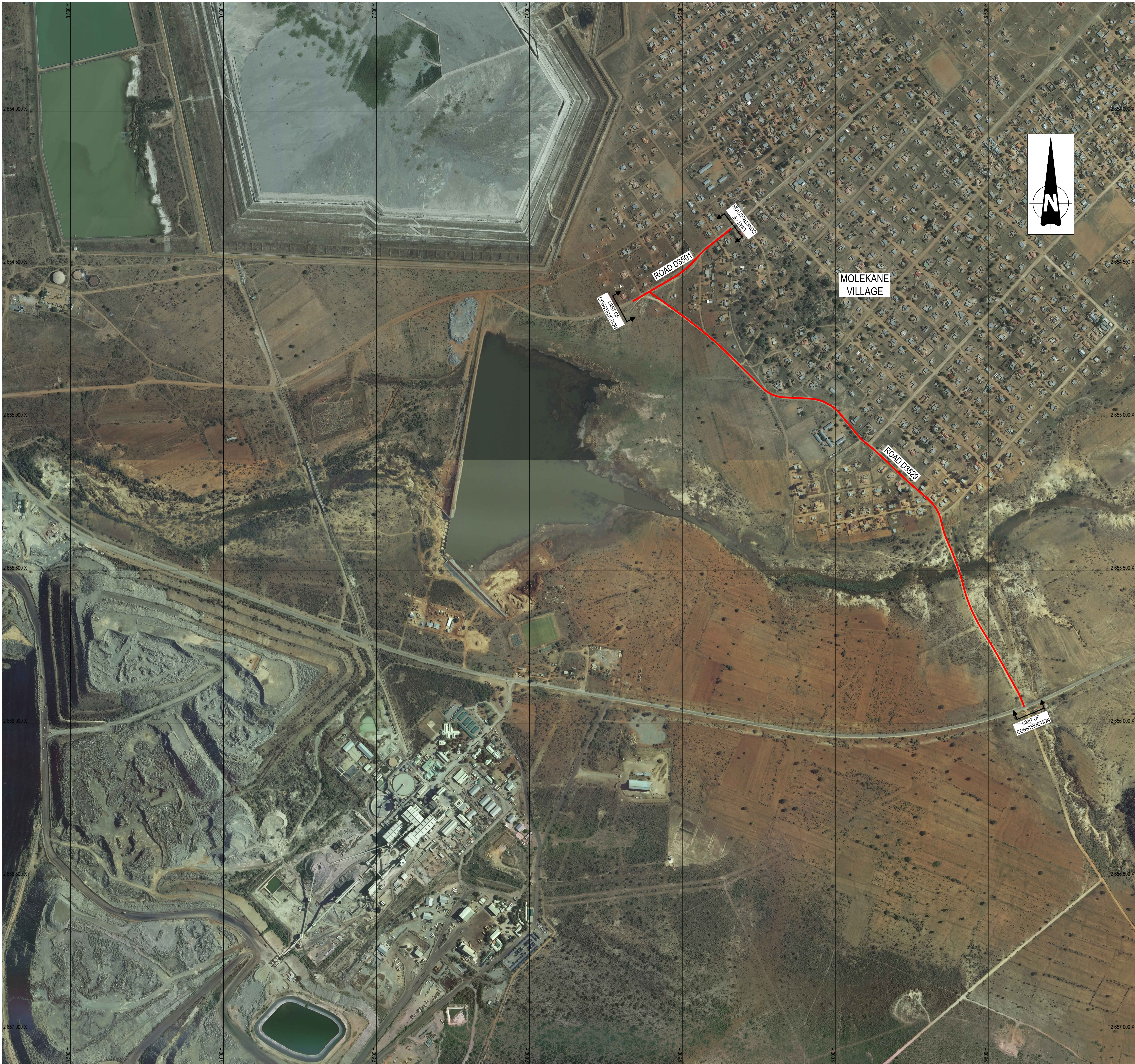
MOLEKANE VILLAGE LOCALITY PLAN SCALE 1:5000